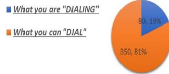
Manual v/s Progressive v/s Predictive v/s OBD; Press 1 based Predictive CRM Dialing

When Revenue is proportional to Connected Leads Per Day